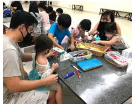
Children from Church of the Holy Cross writing a special Easter message to be attached to their gift for our FINs.

These two Conferences joined forces and launched Share A Hope Project to help fulfill the hope of our FINs. This included lending a hand to help FINs move to new homes, say a prayer for special intentions, spend some time with the FINs as well as donating a meal or two and household items like a fan, pillow or washing machine. With strong support from parishioners, many of the “hopes” were quickly taken up.