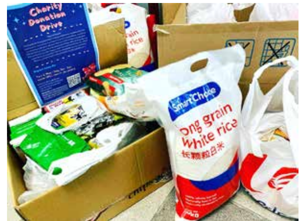
Groceries donated by parishioners from Church of Divine Mercy and students from Hai Sing Catholic School.

The students of Hai Sing Catholic School also joined in the effort to donate the needed items as part of the school's Lenten project. Groceries were collected from parishioners on the last Sunday of the month over three months.