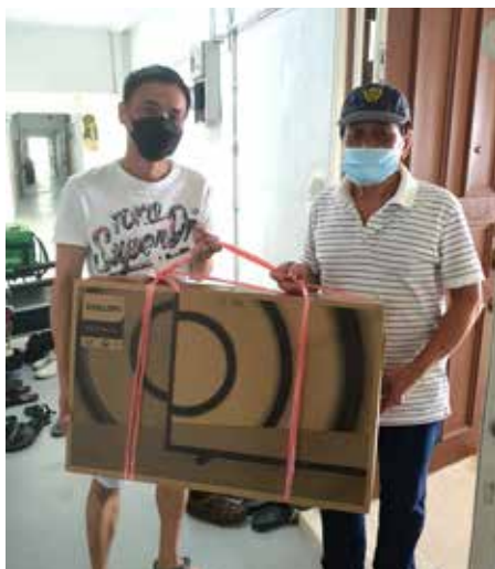
FINs have their Lenten wishes fulfilled in time for Easter!