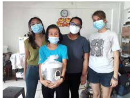
SSVP Youth Team with Vincentians and FINs from SPP Conference.