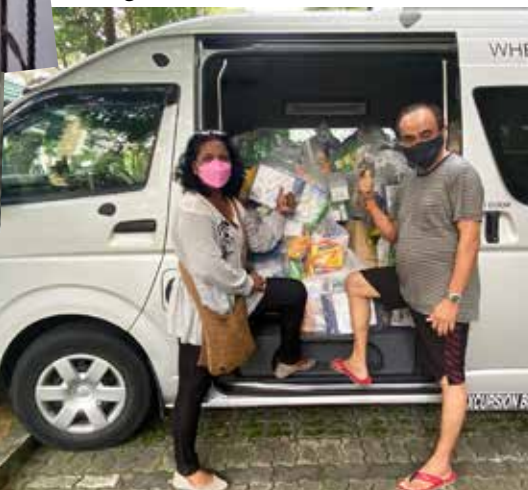
Vincentians delivering the carepacks