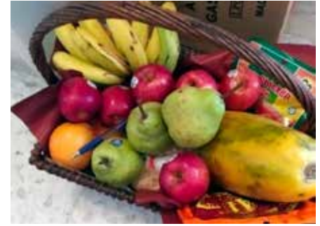
Fruits and a gas-oven burner; simple and practical gifts for our FINs.

with the distribution and were all smiles despite the wet weather.