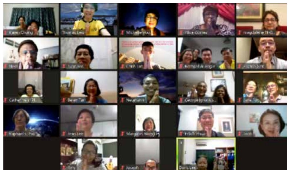
Our Combined Thanksgiving Prayer Session on Feb 5, 2021 which marked the end of the Programme.