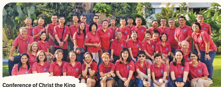
Conference of Christ the King