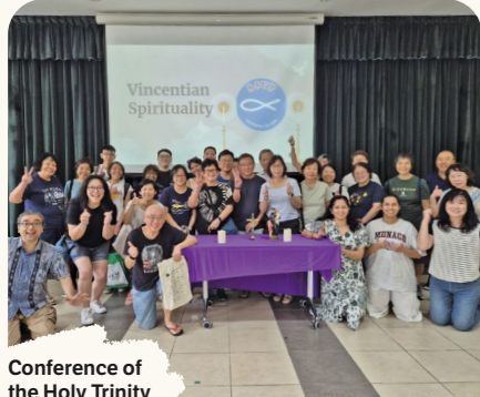
Conference of the Holy Trinity