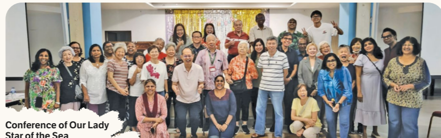
Conference of Our Lady Star of the Sea