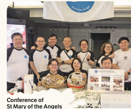
Conference of St Mary of the Angels