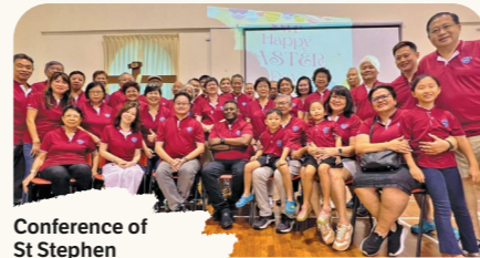
Conference of St Stephen