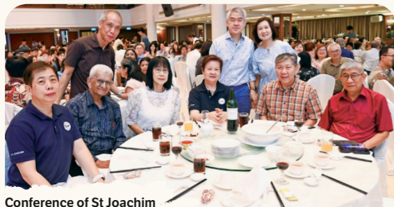
Conference of St Joachim