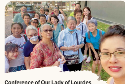
Conference of Our Lady of Lourdes