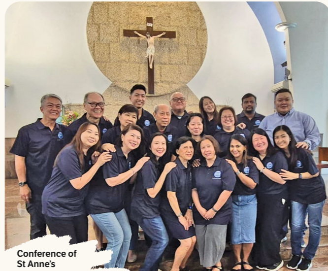
Conference of St Anne's