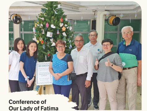
Conference of Our Lady of Fatima