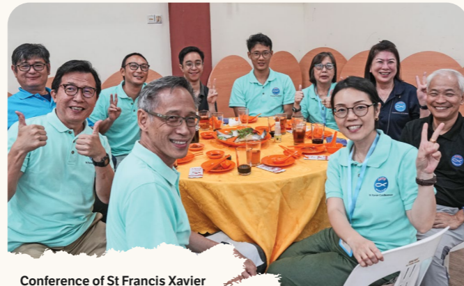
Conference of St Francis Xavier