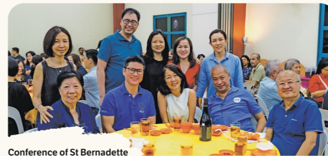
Conference of St Bernadette