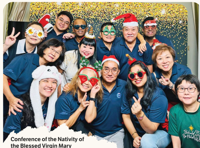
Conference of the Nativity of the Blessed Virgin Mary