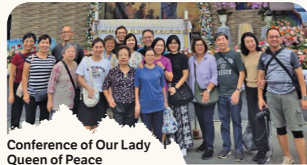
Conference of Our Lady Queen of Peace