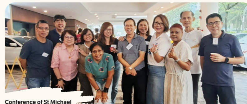
Conference of St Michael