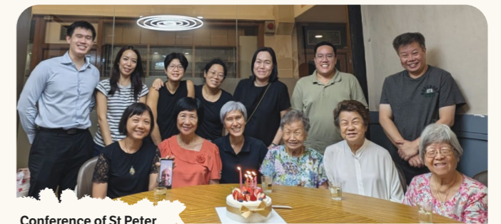
Conference of St Peter