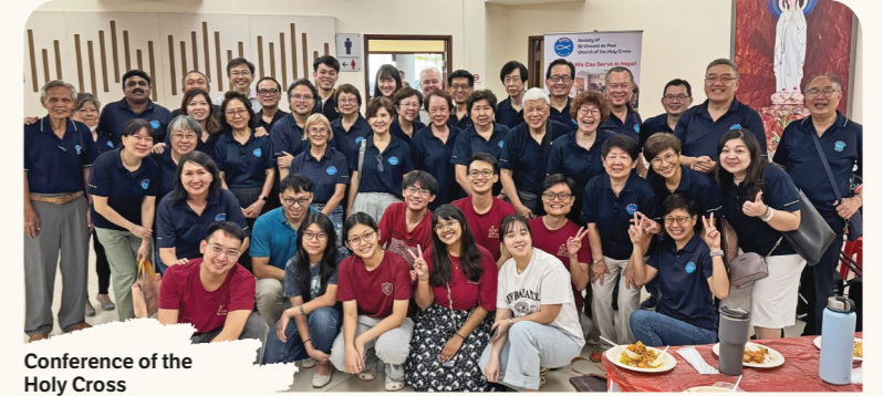
Conference of the Holy Cross