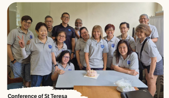
Conference of St Teresa