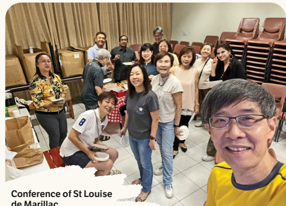
Conference of St Louise de Marillac