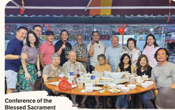
Conference of the Blessed Sacrament