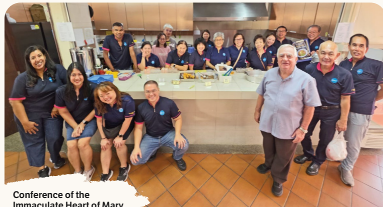
Conference of the Immaculate Heart of Mary