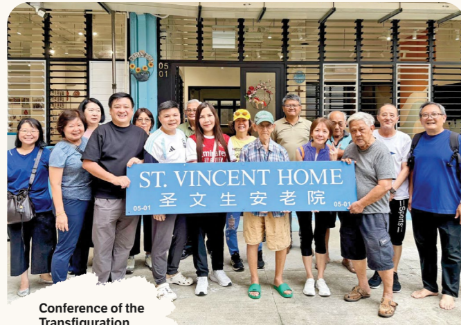
Conference of the Transfiguration