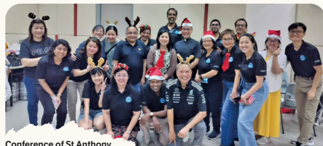
Conference of St Anthony