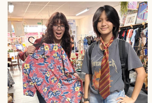
The new SSVP Shop Katong combines a fresh, contemporary look and a significantly larger retail space with the same warmth and vibe.*