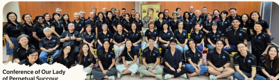
Conference of Our Lady of Perpetual Succour