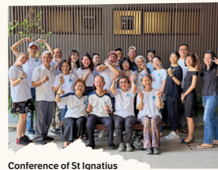
Conference of St Ignatius