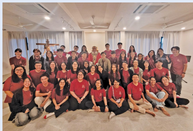
– at our SSVP Youth flagship events, of course!