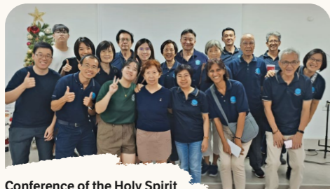
Conference of the Holy Spirit