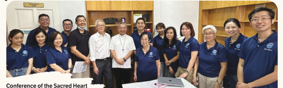
Conference of the Sacred Heart