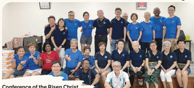
Conference of the Risen Christ